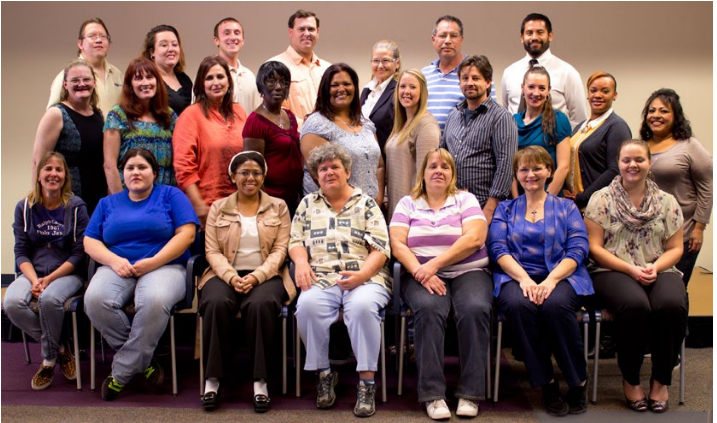
Back Row (L to R)